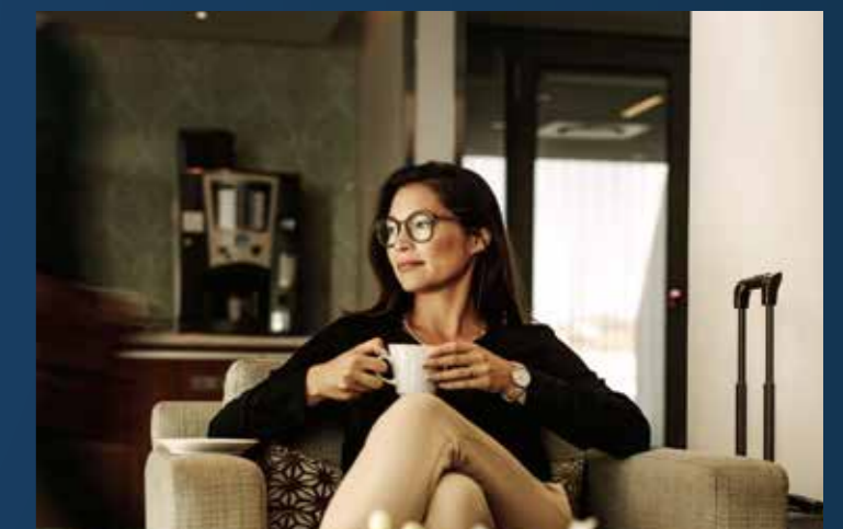
UNIVERSAL ACCESS MEMBERSHIP CARD