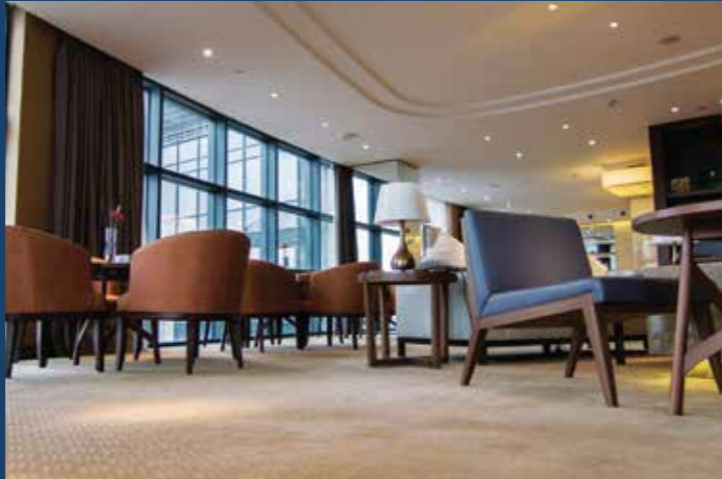
EXCLUSIVE PRIVATE LOUNGES